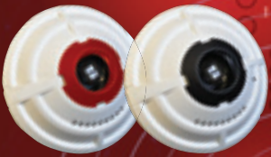
Beam Sensors (pair)