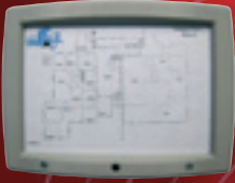
A3 Zonal Mimic